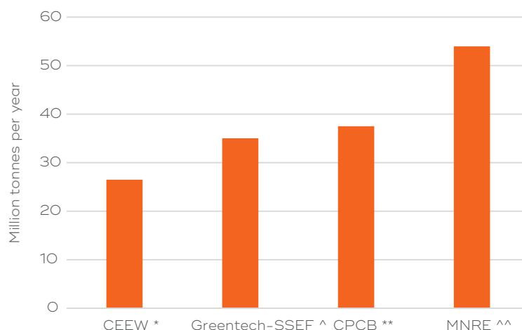
Figure 2: Comparison between different studies on coal consumption in the brick industry

*: Estimates of organised sector (ASI) for 2013-14, and unorganised sector (NSSO 73rd) for 2015-16